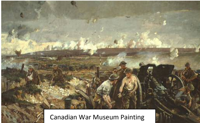
Canadian War Museum Painting